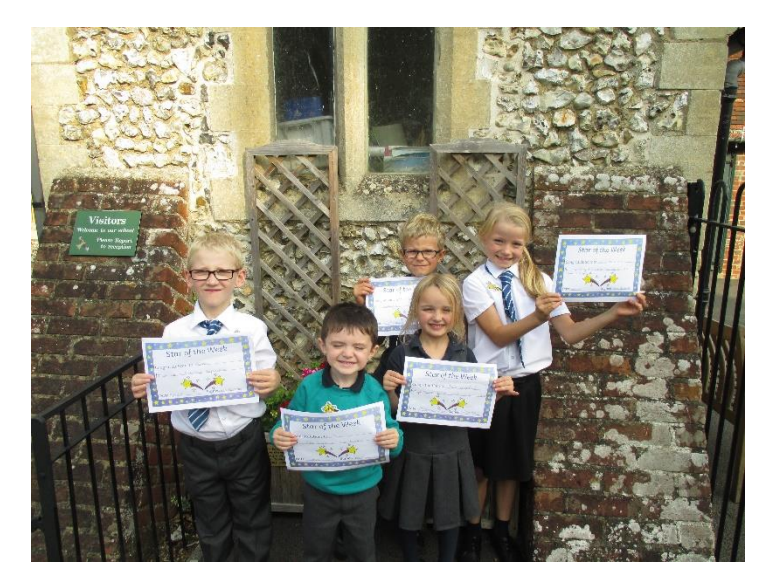
Diary Dates New or amended dates in BOLD