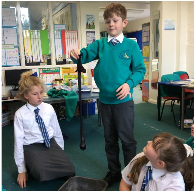
Love – Courage – Respect – Community - Perseverance